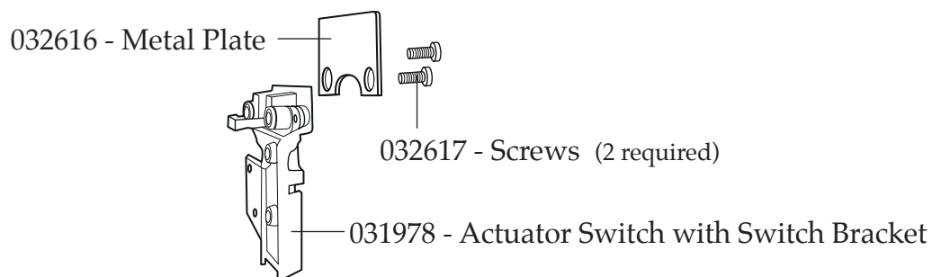
Parts of 030699